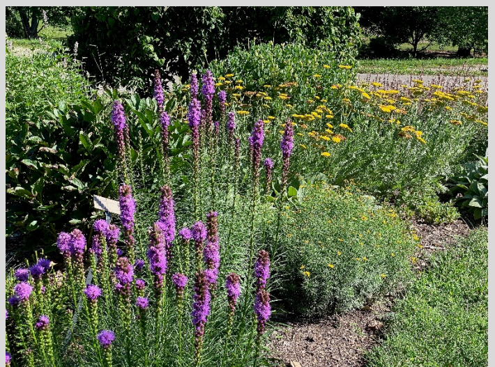
Pollinator Garden at Dawes Arboretum